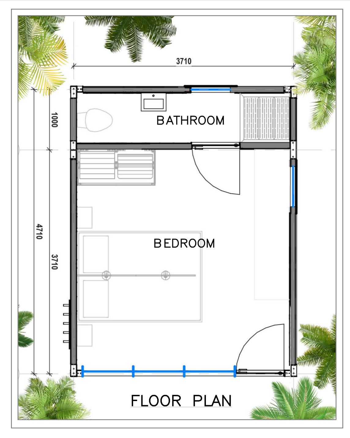
INTERNAL LAYOUT MAY BE CUSTOMISED